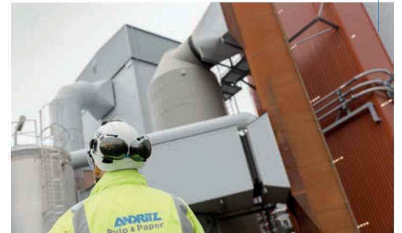
The ANDRITZ flue gas cleaning system consists of ESP, a TurboSorp system (semi-dry flue gas cleaning system), a bagfilter, and flue gas condensation. The TurboSorp plant separates the acidic components from the flue gas.

ensure that everybody was aware not only of the cost, but also of the ultimate benefits of the project.